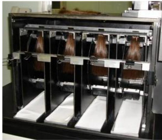
Figure 1: Repeated Groomer

Our methodology utilizes a custom-built automated grooming device shown below. It consists of a hollow rotating drum-like assembly, where four outer crossbars contain holders for mounting combs or brushes. These outer arms are detachable to allow for different holders to be mounted and experiments to be performed using a variety of combs or brushes. The four combs or brushes are mounted at 90° angles – allowing one complete drum revolution to comb (or brush) a tress four times. This entire set-up is duplicated three times in the horizontal direction allowing four tresses to be combed simultaneously. Collection plates are located under each tress to save broken fiber fragments, while spacer plates on the rotating drum prevent cross contamination. All experiments were again performed after overnight equilibration of the hair at 60% RH.